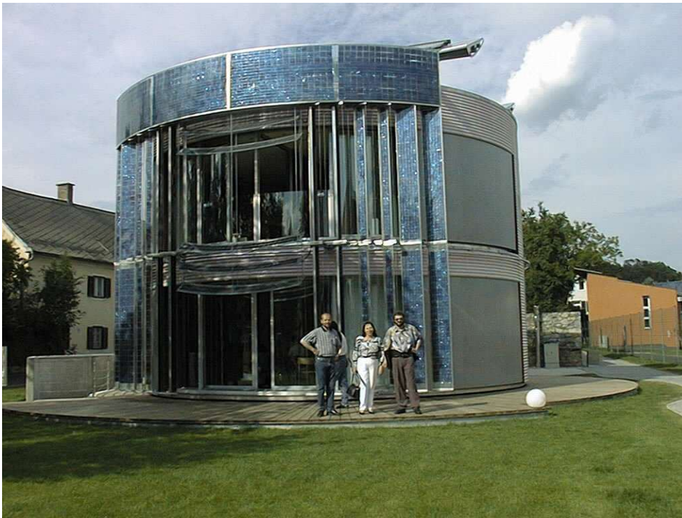
The project “cheap housing” 2018 evolved 2019 into the project “GEMINI next Generation”.