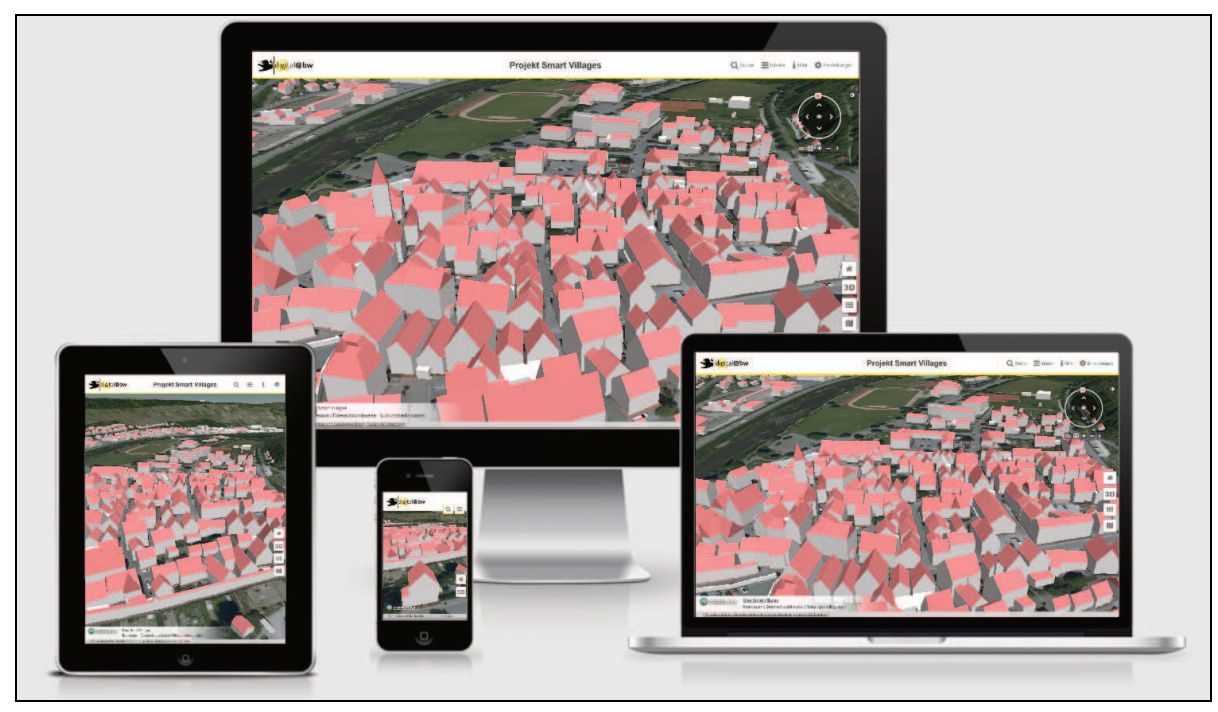
Figure 3: Multi-platform approach

These users are managed by their email address and a created password. The users have not only roles but also groups. The groups allow on the frontend to share the planning with specific people. This used when a user created planning and wants the jury to see it. In this case, he can share it with the group of jury members.