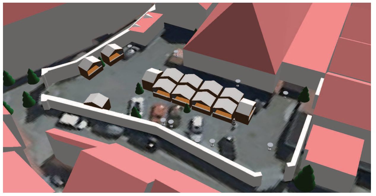
Figure 1: Exemplary design of the Area

The city of Niedernhall is the selected Area for testing the platform. The city has a population of around 4000. Niedernhall is selected because, apart from being interested and open to the project, is of a size that would make it difficult to maintain an own 3D Web application. As a focal point in Niedernhall, a public place near the city center is chosen. The place is redesigned because the surrounding area is renovated and repurposed.