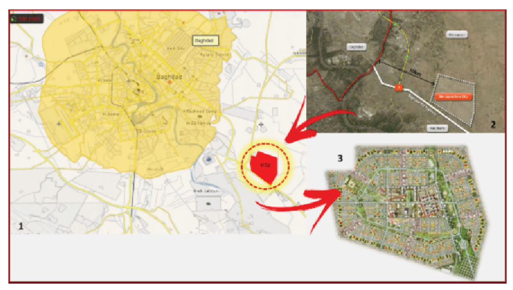
Fig. 1: Location according to Baghdad & site plan for Bismayah city

The Department of chemical monitoring of the Environment Ministry of Iraq carried out an environmental assessment of the site and produced models to ensure that it is free from any contaminants from its previous use as shooting fields.