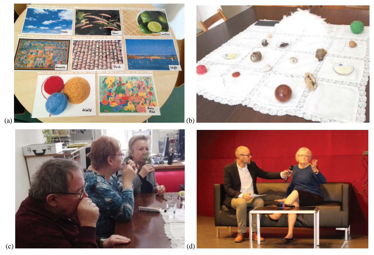
Fig. 2: Employment of the co-creation team in 'Genussschule' and participative engagement. Genussschule: (a) visual stimuli, (b) tactile stimuli, (c) sense of olfactory experience, (d) participatory engagement in public workshop.

• The best source of pleasure is daily life.