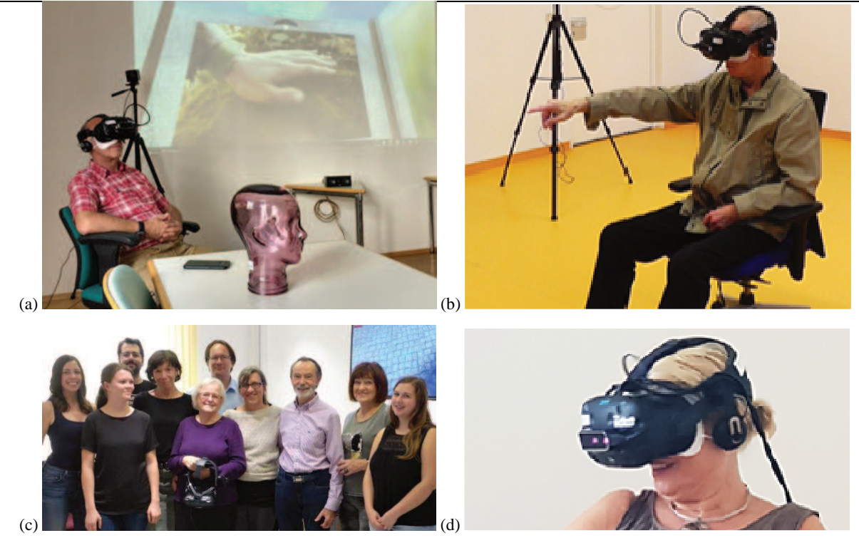
Fig. 1: Investigation of fundamental design parameters for the development of efficient Virtual Reality (VR) technologies in cooperation with different co-creation and study groups: (a) Joyful and focused experience of direct and imaginated perceptions. (b) User in the pilot study. (c) The co-creation group contributed substantially to the design process by means of positive user experience - meeting at the Human Factors Lab<sup>1</sup>, (d) end user in the VR-based prototypical study.