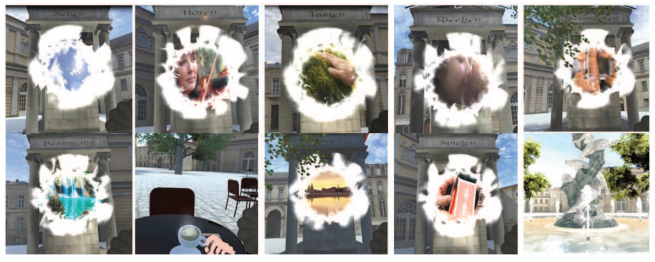
Fig. 5: Portals of specific perception channels: 'vision', 'hearing', 'touch', 'smell', 'taste' (top row), 'reflection', 'encounter', 'travel', 'play' und 'fountain' (bottom row).

version was based on manual interaction based on an IR camera mounted on the HMD for the real-time detection and pose recognition of hand and fingers. The users were following well this type of interaction which allowed a comprehensive implementation of related technical triggers in the portal components.