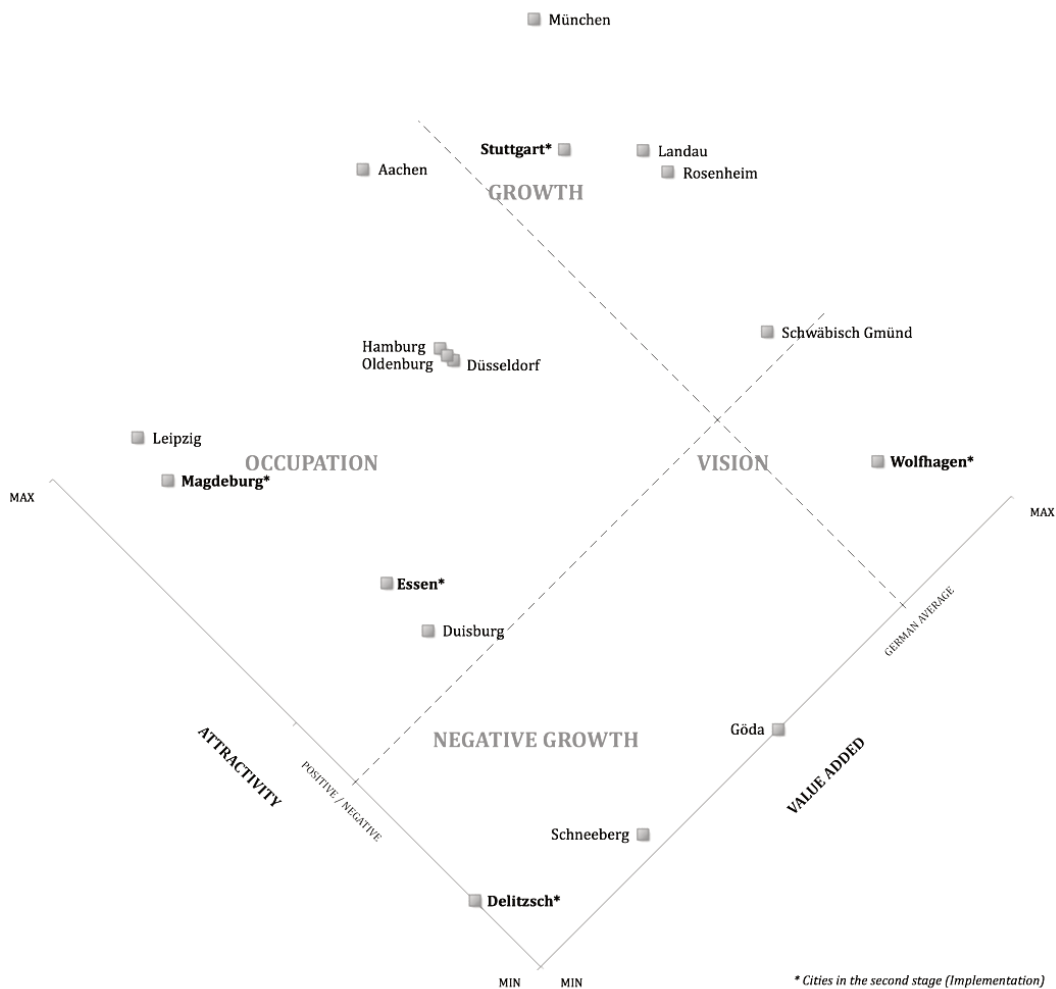
Figure 2: Cities participating in the Energy-Efficient City Contest and their Concerns in Urban Development

To illustrate the gaps in dynamics between the cities, the data were normalized and in case of “Dimension B” subsequently inverted. The data were transferred to a graph that shows following results (cf. Figure 2):