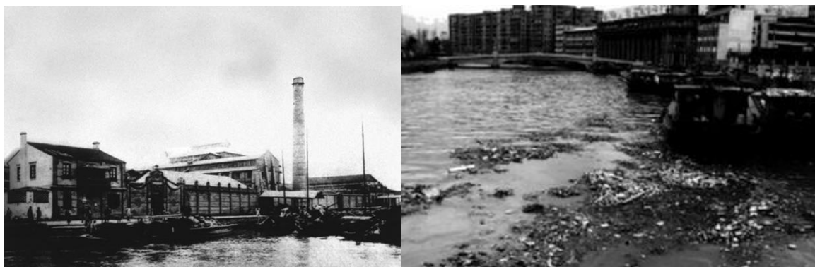
Fig. 3: The early factories and river pollution after industrial boom

In 1930s, a reporter Dong Ping wrote in his book Interviews of the Slum: Suzhou river of Shanghai rotted like a dead snake. From Caojiadu to Fanwangdu, the erosion was too heavier too be recognized that the water polluted by sludge became terribly black and stinking.