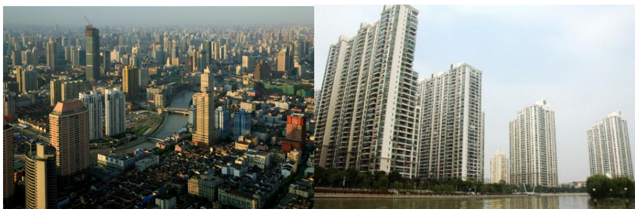
Fig. 6: The image of High-grade Close Residential along the riverside that made the river landscape into private

The profit-chasing of capital is quite manifesting in the coastal development of Suzhou River. With the constant listing of new houses in market, the Suzhou River area has been divided into blocks by land agents. Property developers lose no time to hang out the banner of Private Garden, the intention of which is quite obvious. They want to take possession of Suzhou River which belongs to the public by themselves. At the same time, most of the new districts alongside the Suzhou River are characterized by Two High and One Low, namely high density, high volume rate and low greening rate. The motivation of property developers is to maximize profit, so they are constantly decreasing the distance between the building and Suzhou River and increasing the height of buildings. Suzhou River will become the Building Canyon in city.