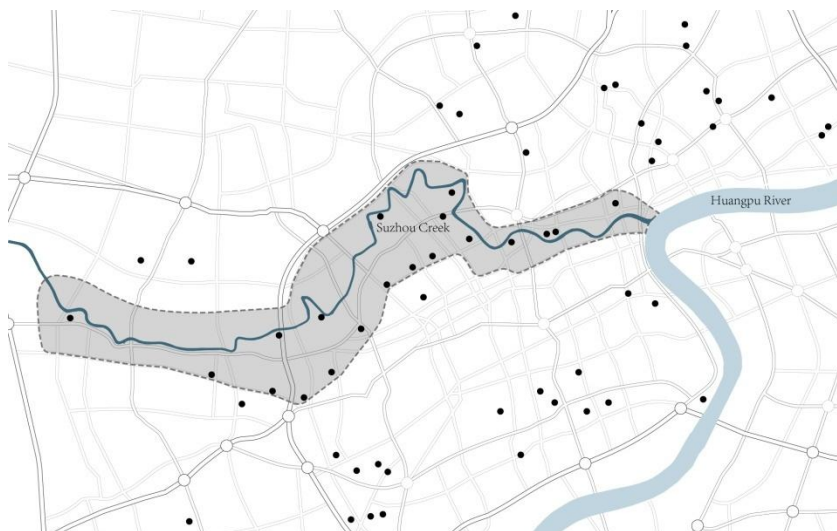
Fig. 5: The distribution of the creative industry along Suzhou river area

administrative regions, forms a group of creative industries feature design, animation, games, media and advertising, and reflects the integration of warehouse culture and riverside culture. Creative activities with creative personnel as the main body gather along the river. The historic buildings rent for self use initially by the artists and creative personnel are gradually leased to other studios. Creative cluster areas form through large-scale investment and creative enterprises settle down as a result of friends' or clients' introductions, so this tightens the social network relationship between enterprises. Therefore, Suzhou River region constitutes the synonym for creative industry as well as culture and art industry, also a must for foreign visitors to hunt for old Shanghai's culture.