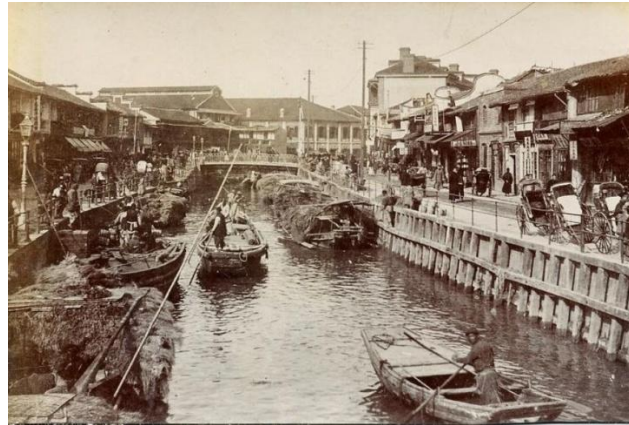
Fig. 2: The old Suzhou River as a hustling trade port

In the 1920s and 1930s, a great number of quay sheds emerged along the riverbank. After Shanghai opened its ports, British businessmen stopped opium trafficking and focused on the trading of raw silk and tea. The light industrial products produced in the upper reaches of Suzhou River were also transported here for storage. As a result, lots of transit sheds and warehouses were built in the 1920s. When it comes to the 1930s and 1940s, numerous Chinese and western banks built frame-structured capped warehouses made of reinforced concrete and without girders, at the back of which the old lanes were renovated into the new-style Shikumen (literally “stone gate”) houses.