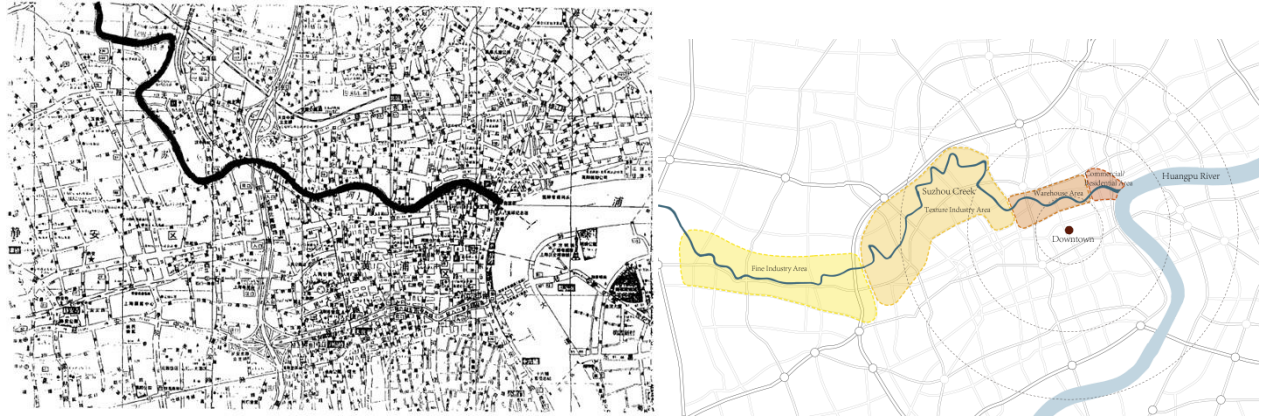
Fig. 1: The position of the Suzhou River and the area for research.

international metropolis of modern Shanghai. It's the Suzhou River, the downstream of WuSongJiang, flows through Shanghai downtown reach into the Huangpu River. It also be called "Suzhou Creek" by British and American who find its superior geographical position very suitable for a inland shipping port. Due to Shanghai's role as trade port, the coast of Suzhou river started her urbanization process, with the expansion of the foreign settlement, from the the east mouth to the west gradually. Since the 1930s, Suzhou Creek became an important shipping route. For more than one hundred years, the process of urban rapid development together with human influence have controlled this area. It covered by the need of social and economic structure change. The modernity history of Suzhou river district reflect the modernization of Shanghai, it also became the typical representative of the course of Chinese modernity.