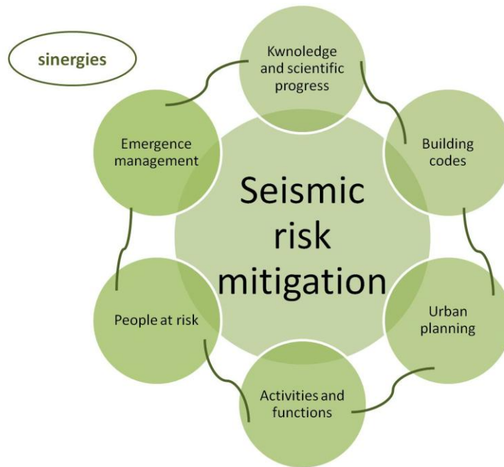
Figure 3: groups of strategies identified in the team map

The obtained team map presents a high level of complexity. It is composed by more than 200 concepts, with an intricate network of relations, both of causality, connotativity, means-ends. This means that team map highlights some possible contributes to seismic risk mitigation. Through map reading and analysis, the possible contributes to seismic risk mitigation have been grouped in six strategies, referred to different domains, and including a certain number of actions, as schematically represented in the next figure: