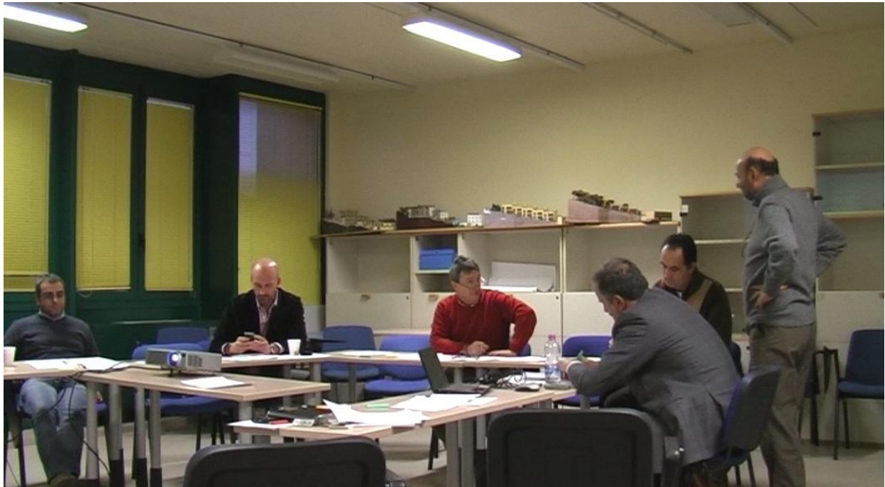
Figure 4: photos from workshop with experts

As mentioned, synergies between the six strategies emerged as necessary to reach the objective. If each strategy is strictly separated from the other ones, the global result will be underdeveloped. A global vision is strongly recommended, in order to make effective each strategy, and avoiding a possible negative resonance, but searching to amplify benefits.