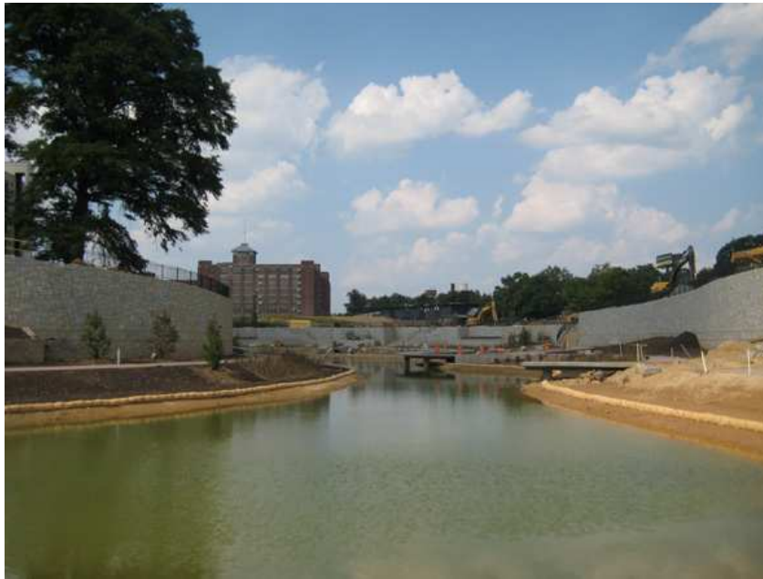
Fig. 4: Detention pond in Old Fourth Ward Park (2010)