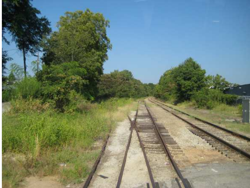
Fig. 2: Abandoned rail corridor (2010)

By the end of the 20th century the Beltline became a series of often neglected green spaces. “The Beltline itself is a compilation of rail rights-of-way that are owned by different parties who have maintained their property and their tracks to varying degrees, from active freight lines to inactive tracks to abandoned property that serves as an illegal garbage dump”(Garvin 1999: 32).