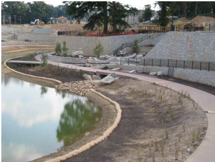
Fig. 5: Initiated wetland vegetation (2010)