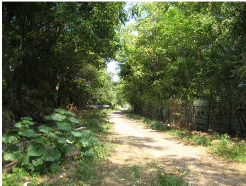
Fig. 3: Footpath on former rail track (2010)