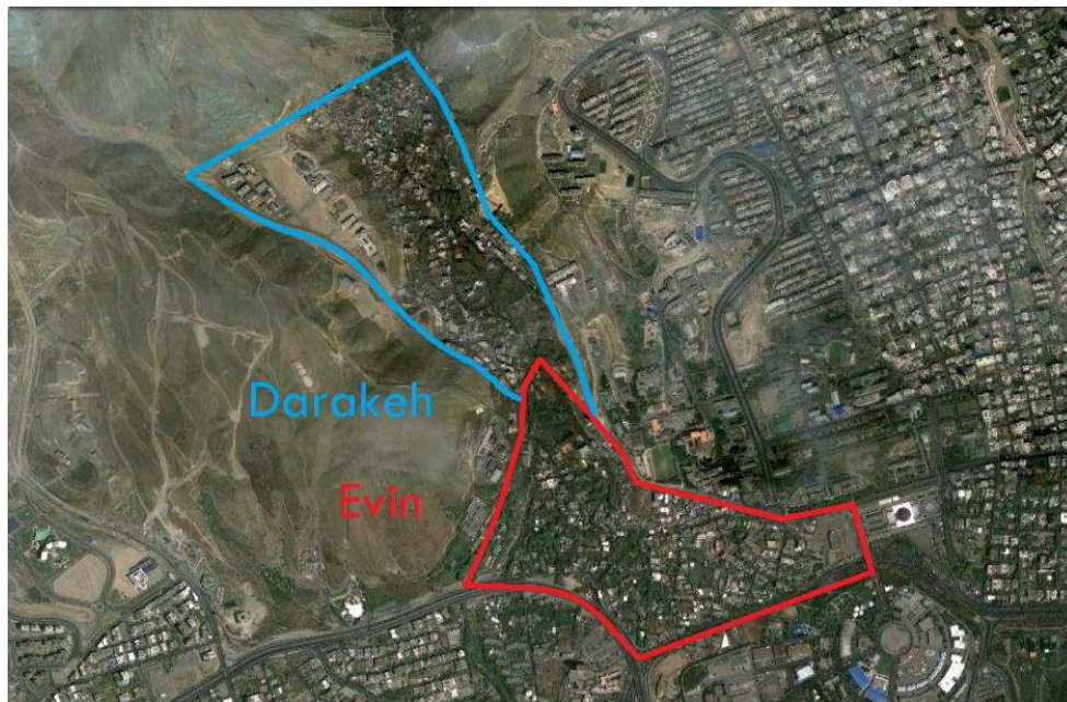
Fig. 2: Evin and Darakeh neighborhoods in Tehran