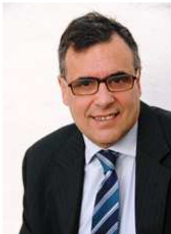
Jordi BAIJET I VIDAL, Mayor of Sitges, Catalunya/Spain